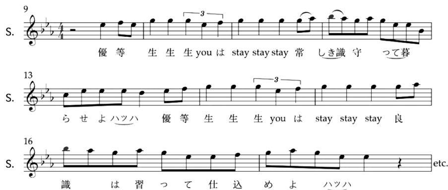
Figure 3. "Elite"

For instance, in the song “Elite” by Chinozo (Figure 3), the composer extends the passage of the soprano’s voice transition note by continually repeating it. The transition of a normal soprano voice happens at F2, while it is unusual to find a song revolving around this note. The song also utilises the B2 note extensively. The B2 note is difficult in reality, while it can be accomplished easily by a virtual singer.