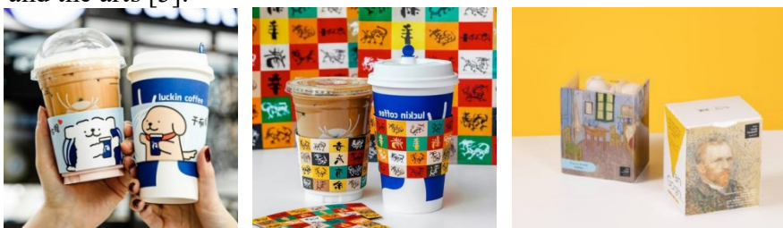
Figure 2: Homogenised style of branded art co-branding [6].