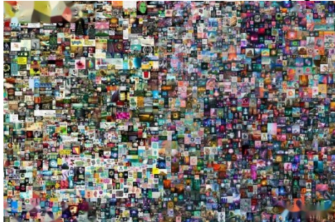
Figure 5: Everyday: The First 5000 Days [13].

Christie's, and in the process opened the eyes of most tradespeople to the value and potential of digital art and NFT, with some tradespeople laughing at the idea that the piece was a gimmick and not worth the price. But on the flip side, Beeple took 5,000 days to create this stunning piece. How is this not the same as a spiritual practice for artistic creation? Such aesthetically pleasing and innovative works that have been polished over a long period are naturally more valuable in the long run than those that are made in the blind pursuit of commercialism and are shoddily produced.