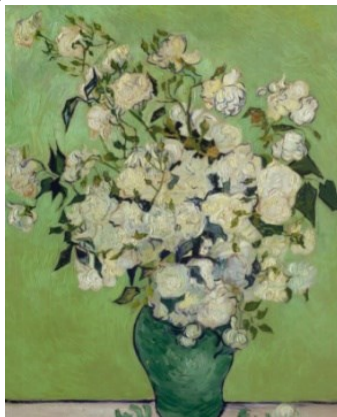
Figure 3: Van Gogh's The White Rose [8].

Aesthetic education is an important part of the education that constitutes the culture of the society, and the ultimate goal is to cultivate sound humanity and noble personality [9]. The proliferation of co-branded works of art has led to a superficial and one-sided understanding of art by a large part of society. Some so-called "literary youth" a piece of art behind the meaning a half-understanding, did not explore the depth of the meaning behind it, such an understanding of the way they lack an