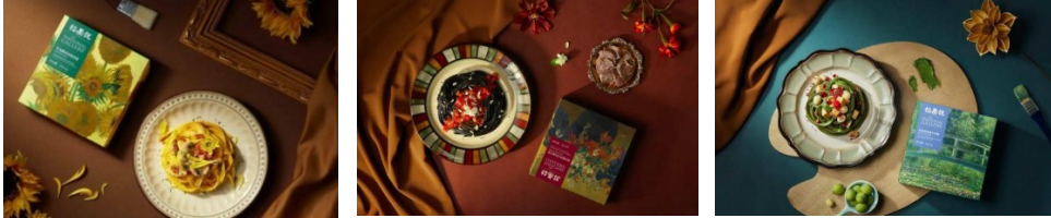
Figure 1: Ramen said and the British Museum co-branded product [4].

ended hastily with low sales as only 3,281 people paid for it on the platform. Therefore, co-branding that is not in line with the brand image cannot strengthen the visual image of the brand and achieve the purpose of enhancing the added value of the brand but will weaken the consumers' memory and loyalty to the brand.